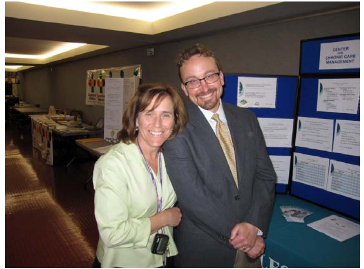
Center for Chronic Care Management

Not pictured: Hartford Department of Health and Human Services, Middlesex Hospital Asthma Program, Region II Asthma Coalition, Connecticut Environmental Health Association, Connecticut Department of Public Health Asthma Program, Connecticut Department of Public Health Environmental Program.