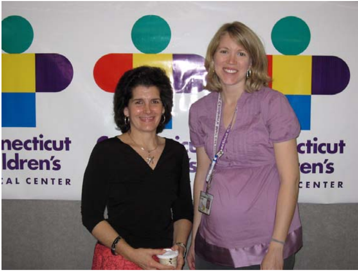
Connecticut Children's Medical Center Asthma Center