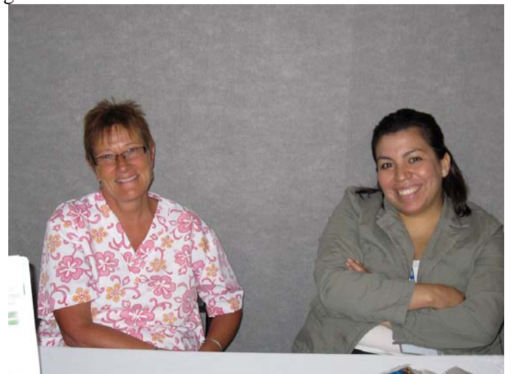
New Britain Asthma Initiative and New Britain Health Dept.