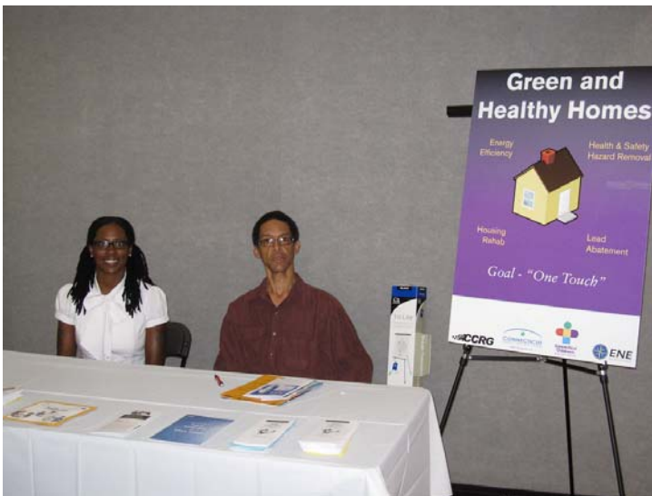
Healthy Homes Project Hartford