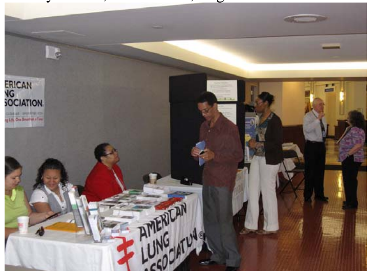
American Lung Association