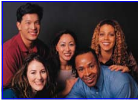
Anyone can help... So Get Involved!

Everyone has the potential to provide strength and resources in times of emergency. You don't have to be a medical professional to help during a public health emergency. Many of the tasks that need to be done, like helping your neighbors fill out a form or making sure people get through a clinic quickly and easily, require only a commitment of your time and a desire to help. The donation of your time and effort can be of significant value in an emergency. Volunteers can help to provide essential services to help their community respond to the situation at hand.