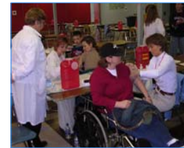
Health departments provide medication and vaccinations in an emergency.

If we all help to perform the necessary tasks, our health department will be prepared to respond to any emergency and protect our community's health!